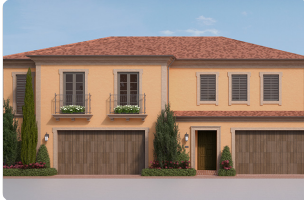
Vista Scena Elevation