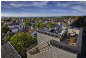
Rooftop View Decks