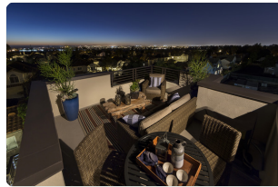
Rooftop View Decks