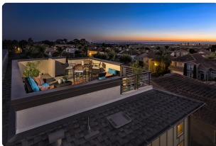
Rooftop View Decks