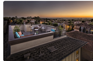
Rooftop View Decks