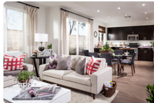
Liberty Walk Living/Kitchen Plan 1