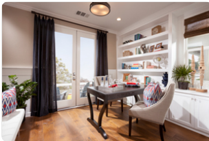
Liberty Walk Den - Plan 2