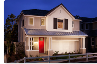
Liberty Walk Plan 1