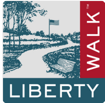
Liberty Walk Logo