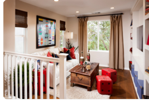
Liberty Walk Loft in Plan 2