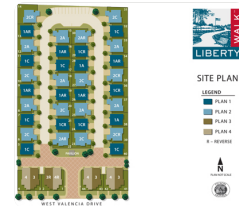
Liberty Walk Site Plan