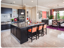
Harmony at Pavilion Park