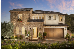
Emerald Heights at Blackstone